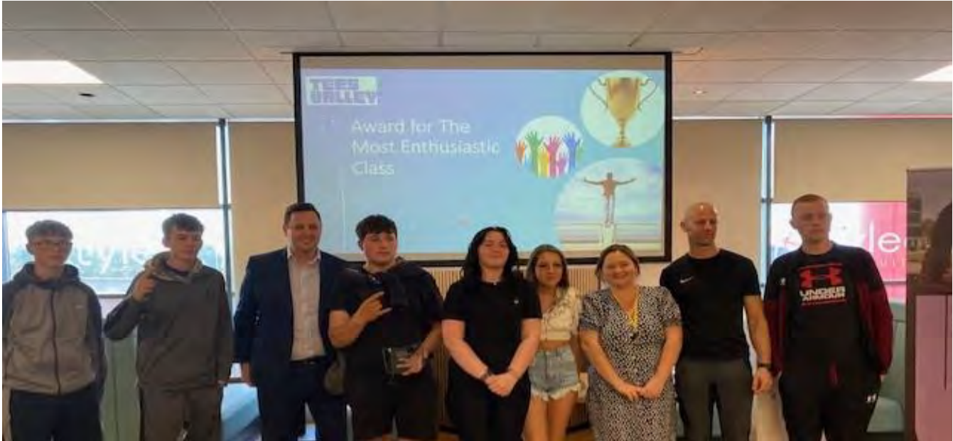
SimFly Work Place Experience...